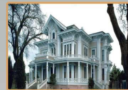
Standalone Access control: House