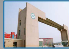
Networked Security: School