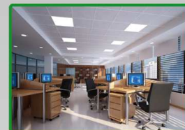
Time Attendance: Office