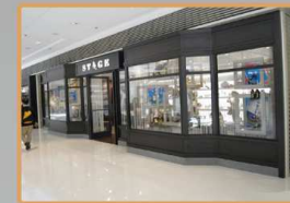
Standalone Access control: Shop