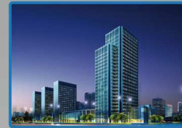
Networked Security: Building