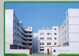
Time Attendance: Factory